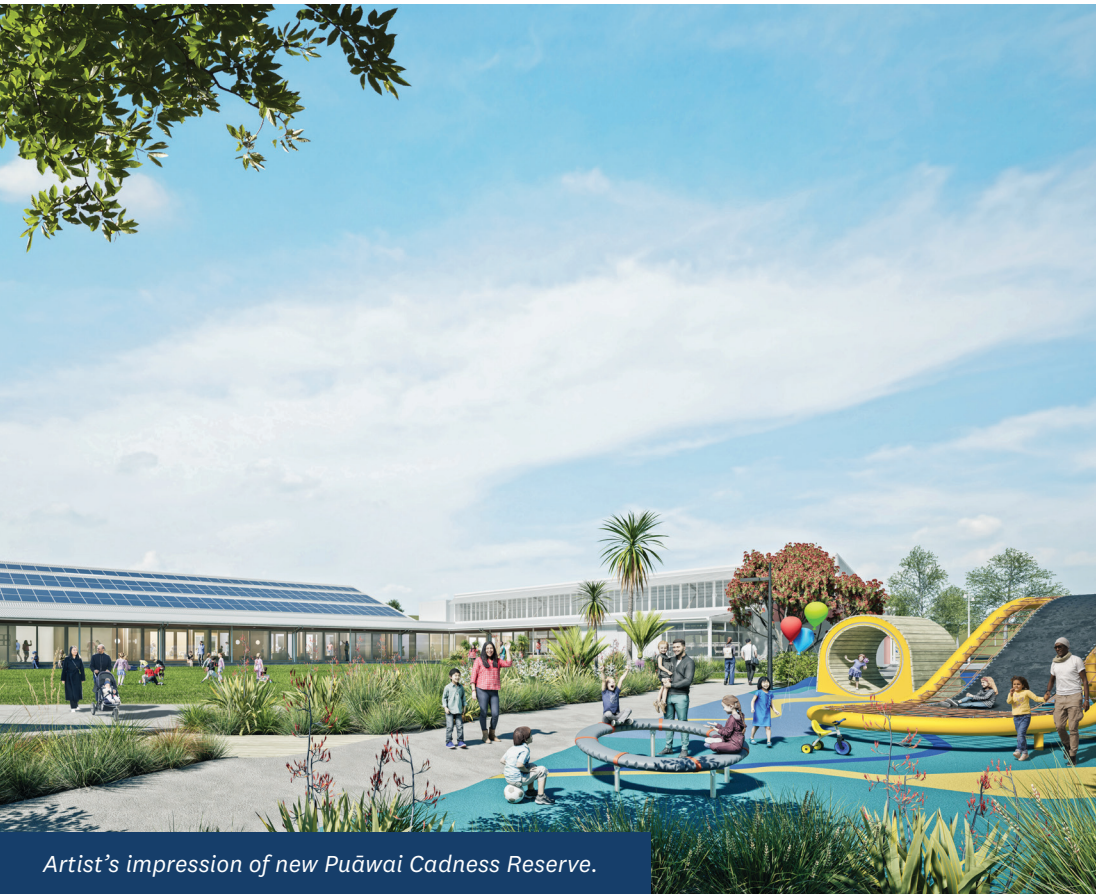
Artist's impression of new Puāwai Cadness Reserve.