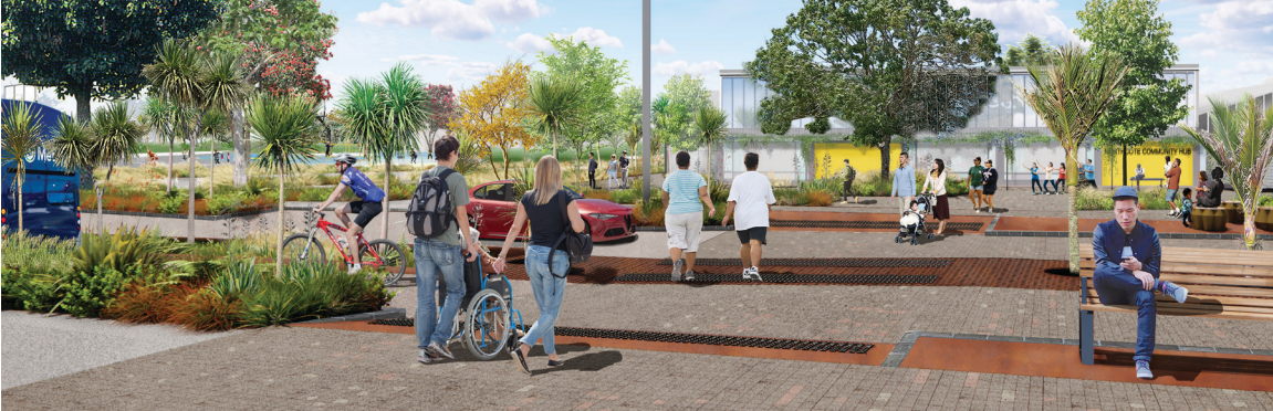
Artist's impression of the new Ernie Mays St extension, with the new community hub in the background.