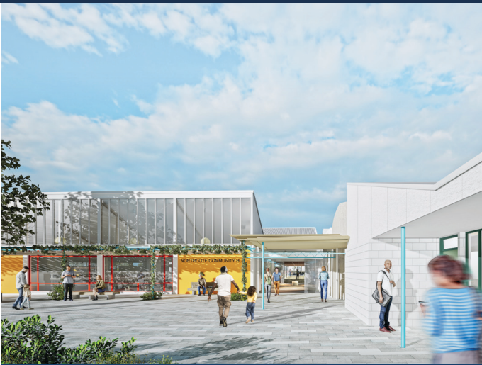
Artist's impression of new Northcote community hub.

Prior to construction, the library will temporarily move to 1 Ernie Mays Street (cnr of College Road) in early 2026.