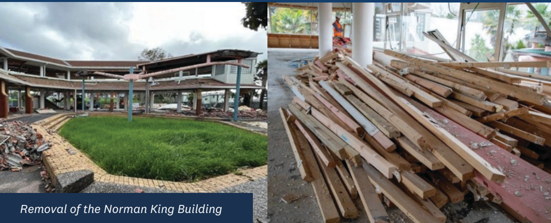
Removal of the Norman King Building